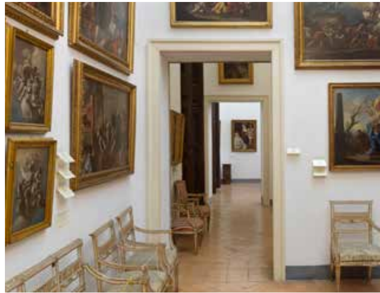
House of the Pio Monte

After some times, the Pio Monte della Misericordia also bought a palace to have a place where to meet. On the ground floor of the palace a church was built where they could pray.